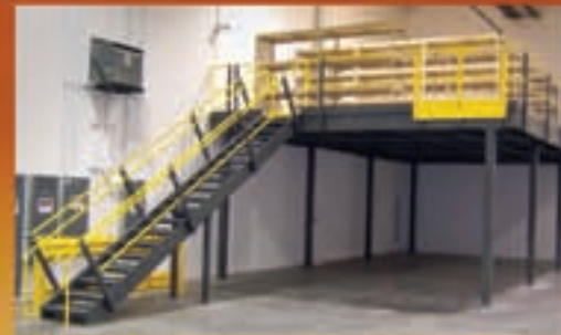
Increase the storage capacity in your dealership with a quality Wildeck mezzanine.