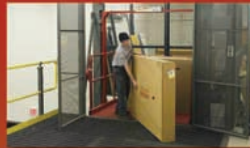
Lifts simplify moving awkward and heavy items to the mezzanine level.

Wildeck Automotive Specialists can help you realize the benefits and tax advantages of installing a mezzanine to improve the efficiency and storage capacity of your parts room.