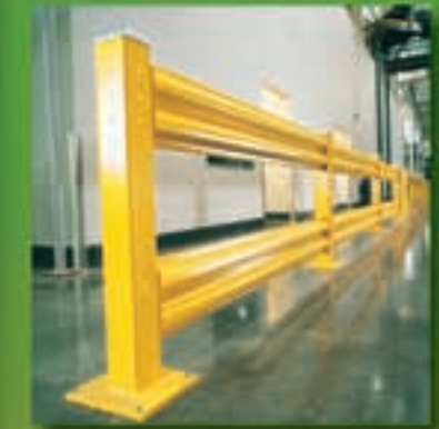
Strong, durable steel Wilgard® guardrail protects equipment, walkways and pedestrians in your facility.

Wildeck manufactures a full line of Guarding Products which include: safety gates, bollards, machine guards, guardrail, railings, etc.