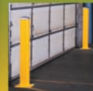
Highly visible Wildeck safety bollards protect your overhead doors and equipment in your service area.