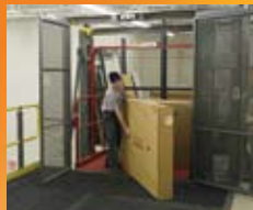
LIFT SYSTEMS Make moving up and down easy