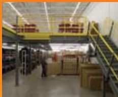
MEZZANINES Get the most out of your space

No matter what's hot, no matter what season, get organized with Wildeck products and watch your sales soar along with your new found space.