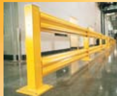
GUARDING PRODUCTS Protect people and inventory